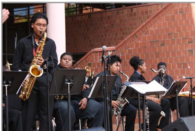
The York College Blue Notes

The college-wide due date for all other first re-appointment portfolios is January 17.