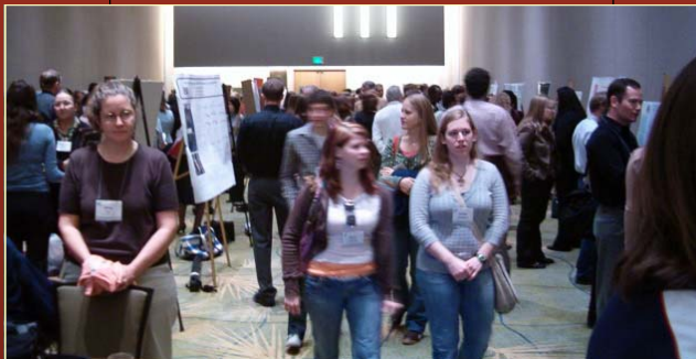
Student poster session at NCHC conference in Denver