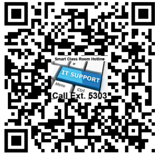
IT Support QR for Smart Rooms

For additional information visit the Hyflex web page on the York web site at https://www.york.cuny.edu/it/e-forms/itaf or if you are having difficulty while in an active class session contact the Service Desk hotline for Smart Rooms at 718-262-5303.