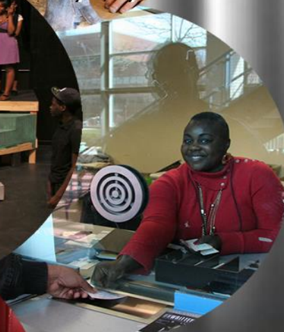
build an audience