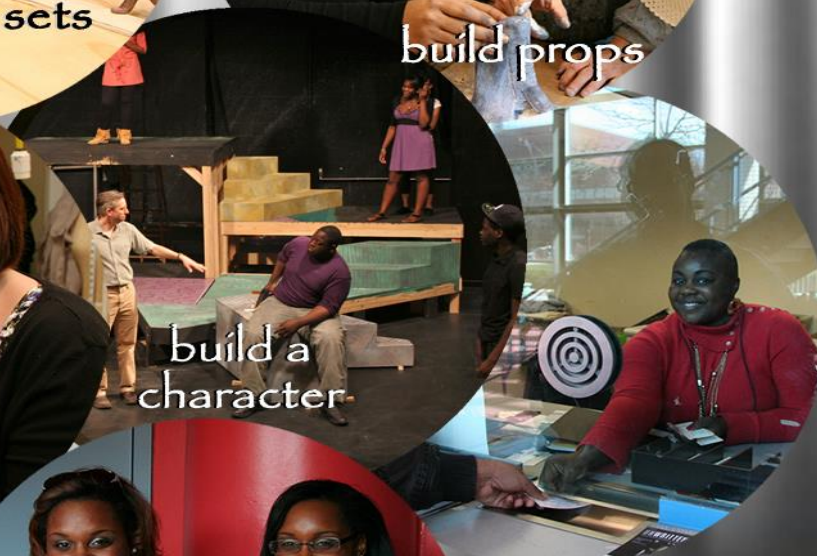
build a character