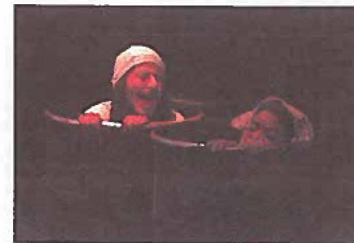
Endgame by Samuel Beckett