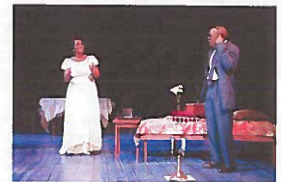
The Glass Menagerie by Tennessee Williams