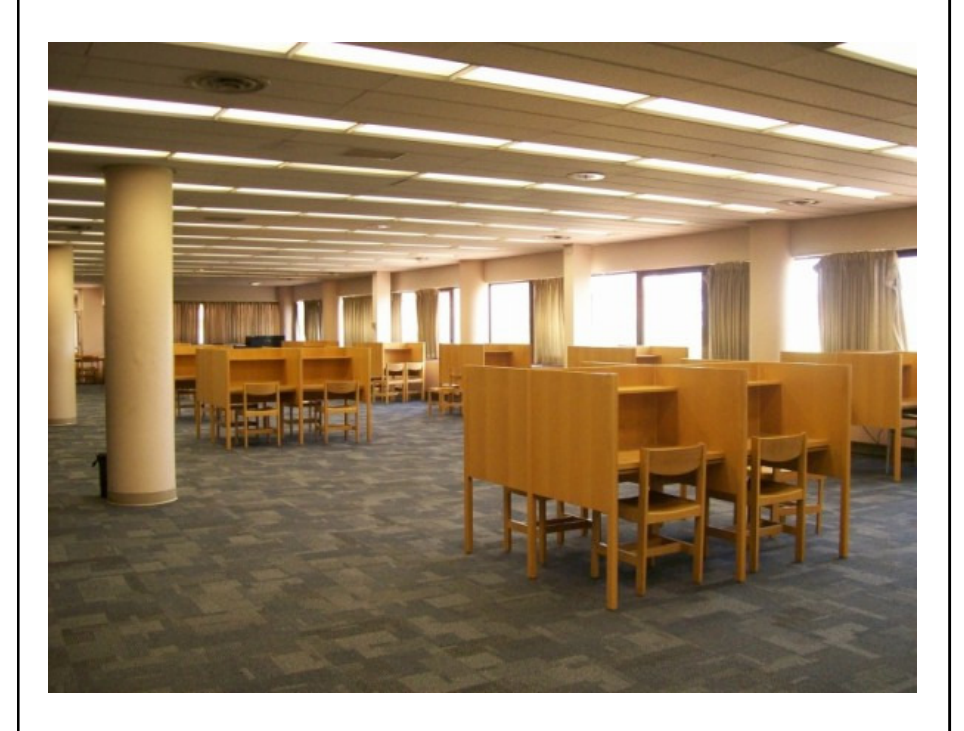
G-Wing Study Area