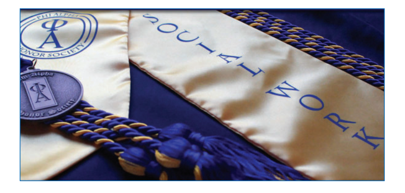
Through Knowledge – The Challenge to Serve Phi Alpha National Honor Society for Social Work