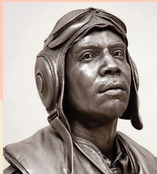
Statue of Tuskegee Airman