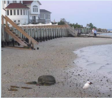
Bird feeding on invertebrates that inhabit a tidal beach vulnerable to rising sea level along Peconic Bay in Riverhead.

Beaches along Long Island Sound and other estuaries may be squeezed between development and the advancing sea. Those beaches provide nesting sites for horseshoe crabs, which are a key source of food during spring for migrating shorebirds, such as the endangered red knot. Other shorebirds feed on these beaches throughout the year. Vulnerable tidal flats provide habitat for soft clam, hard clam, bay scallop, and blue mussel.