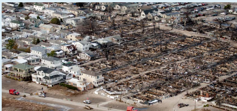
Breezy Point, Queens, in the aftermath of an electrical fire ignited by floodwaters during Hurricane Sandy.

Rising sea level increases the vulnerability of coastal homes and infrastructure to flooding because storm surges become higher as well. Although hurricanes are rare, much of the infrastructure in the New York metropolitan area is vulnerable to flooding. In 2012, high waters during Hurricane Sandy flooded Amtrak, PATH, and subway tunnels, as well as electrical substations, wastewater treatment plants, telecommunication facilities, hospitals, and nursing homes. Wind speeds and rainfall rates during hurricanes and tropical storms are likely to increase as the climate warms. Rising sea level is likely to increase flood insurance premiums, while more frequent storms could increase the deductible for wind damage in homeowner insurance policies.