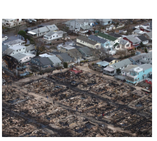
Sandy wreaked havoc in wide parts of Queens

As Hurricane Sandy's promised fury forced thousands from their homes throughout New York City, York College and its fellow-CUNY campuses played hosts to more than 2,000 evacuees. The Health and Physical Education Complex (HPEC) became a make-shift hospital for patients brought in from area nursing homes while the Academic Core Building home-awaybecame from-home for those who came or were brought in directly from their homes to avoid or escape the onslaught of the "super hurricane."