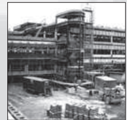
Academic Core Under Construction in 1982

With the fiscal crisis of the mid-seventies, York's future seemed uncertain. Jamaica residents, eager to have the college in the neighborhood, pressured the city to keep York's doors open. In May 1978, the CUNY Board reaffirmed York's permanence by authorizing construction of the new campus in Jamaica. At the same time, the College underwent expansive curricular development. While York maintained an emphasis on the liberal arts, it began to offer career-related majors in the health professions. The College also opened the Office of Continuing Education to give classes on practical subjects to Jamaica's residents.