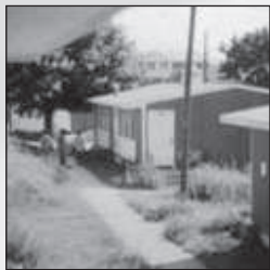
"Portables" at QCC Bayside