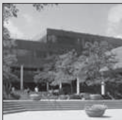
York College Today

In 2009 alone, York launched the Provost Distinguished Scholars Lecture Series, which attracts renowned writers, scholars, and scientists to speak to the York community. York also hired thirty-three new faculty members and reorganized its 18 academic departments into three schools, the School of Arts and Sciences, School of Business and Information Systems and School of Health and Behavioral Sciences.